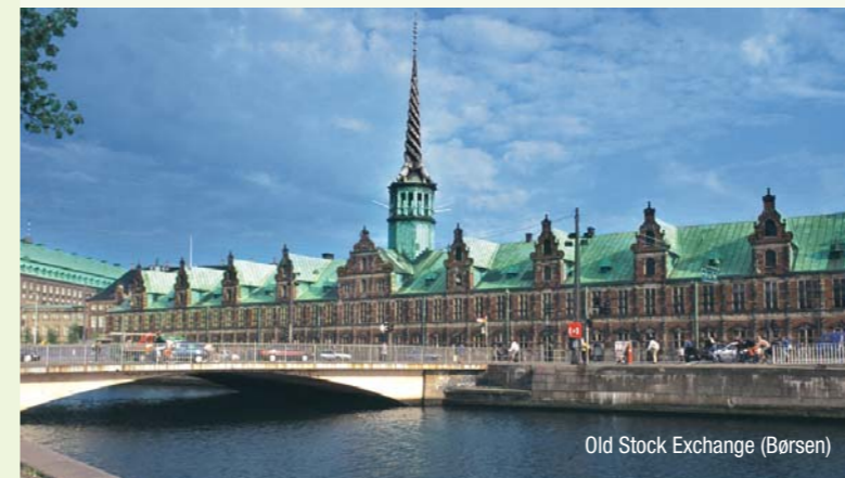
Old Stock Exchange (Børsen)